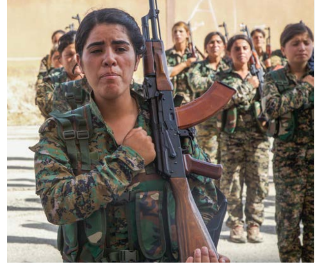
Syrian Democratic Forces trainees, representing an equal number of Arab and Kurdish volunteers, stand in formation at their graduation ceremony in northern Syria, August 9, 2017.

Promoting liberalization in Belarus likely would not succeed and could provoke a strong Russian response, one that would result in a general deterioration of the security environment in Europe and a setback for U.S. policy.