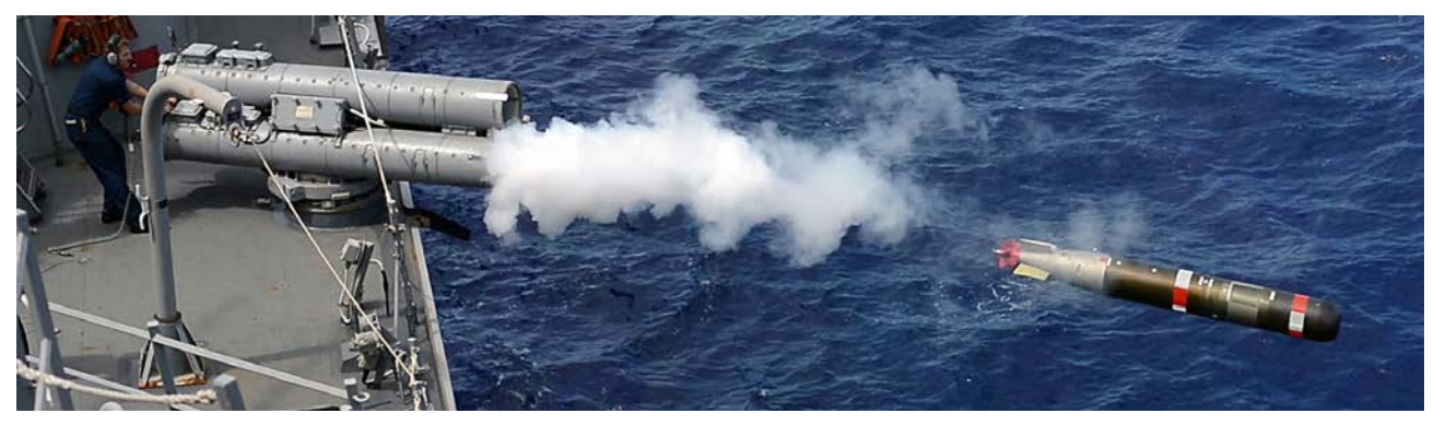
A U.S. sailor aboard the guided missile destroyer USS Mustin (DDG 89) fires a torpedo at a simulated target during Valiant Shield 2014 in the Pacific Ocean September 18, 2014.

Increasing U.S. and allied naval force posture and presence in Russia's operating areas could force Russia to increase its naval investments, diverting investments from potentially more dangerous areas. But the size of investment required to reconstitute a true blue-water naval capability makes it unlikely that Russia could be compelled or enticed to do so.