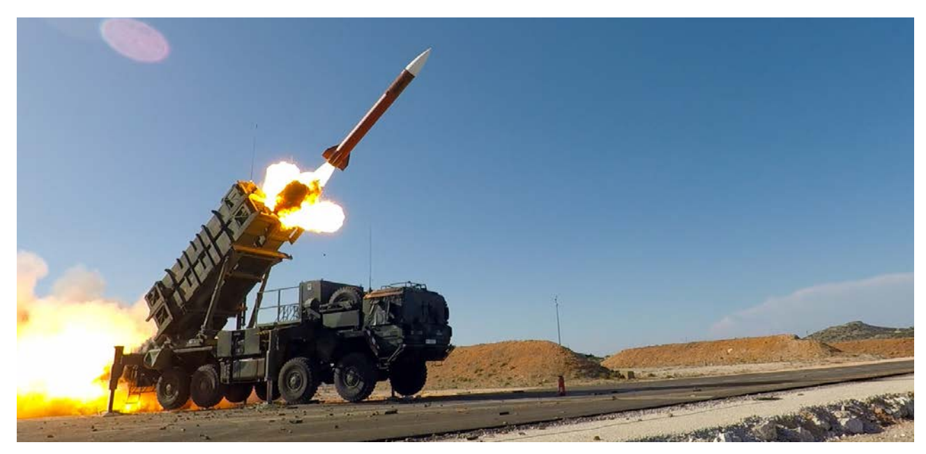
Exercise Artemis Strike was a German-led tactical live-fire exercise with live Patriot and Stinger missiles at the NATO Missile Firing Installation in Chania, Greece, from October 31 to November 9, 2017. More than 200 U.S. soldiers and approximately 650 German airmen participated in the realistic training within a combined construct, exercising the rigors associated with force projection and educating operators on their air missile defense systems.

The task of "extending Russia" need not fall primarily on the Army or even the U.S. armed forces as a whole. Indeed, the most promising ways to extend Russia—those with the highest benefit, the lowest risk, and greatest likelihood of success—likely fall outside the military domain. Russia is not seeking military parity with the United States and, thus, might simply choose not to respond to some U.S. military actions (e.g., shifts in naval presence); other U.S. military actions (e.g., posturing forces closer to Russia) could ultimately prove more costly to the United States than to Russia. Still, our findings have at least three major implications for the Army.