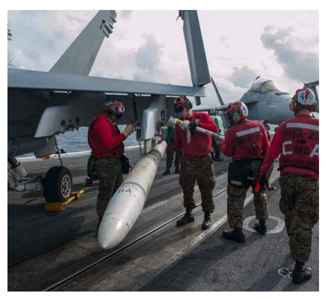
Marines assigned to the Thunderbolts of Marine Fighter Attack Squadron (VMFA) 251 remove a training AGM-88 HARM from an F/A-18C Hornet on the flight deck of the Nimitz -class aircraft carrier USS Theodore Roosevelt (CVN 71).

A key risk of these options is being drawn into arms races that result in cost-imposing strategies directed against the United States. For example, investing in ballistic missile defense