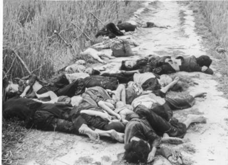
A clump of bodies on a road in South Vietnam.

128TH YEAR—NO. 324 • • • • • 96 PAGES 10 CENTS